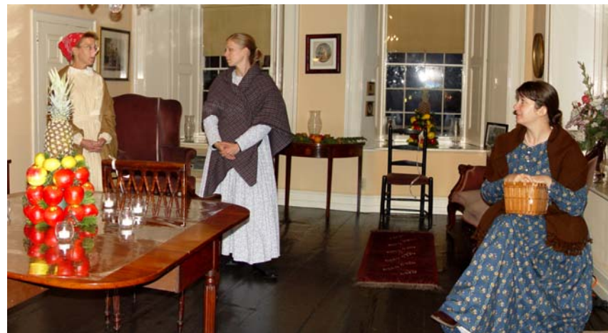
Larkin House was enthusiastically hosted by the Officer Student's Spouses Club of the Naval Postgraduate School.