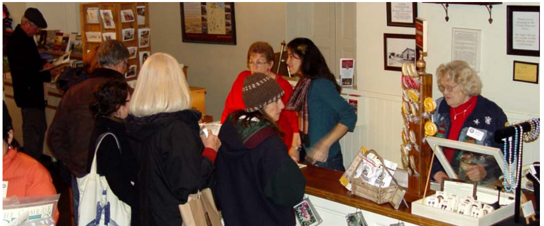
Cooper Museum Storekeepers were kept busy during the 2011 Christmas in the Adobes.