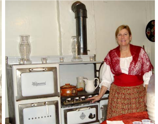
Casa Soberanes was filled with the strains of William Faulkner's Jalisco harp while knowledgeable docents answered questions about the adobe. Visitors tasted agua frescas served by capable MSHP volunteers.