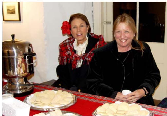
CITA guests were able to admire the fine furnishings and art in Robert Louis Stevenson House before concluding with shortbread and Scottish tea.